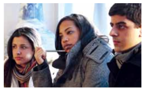
While in Beijing, GSA students visited health facilities and community organizations to learn about health and development in China.