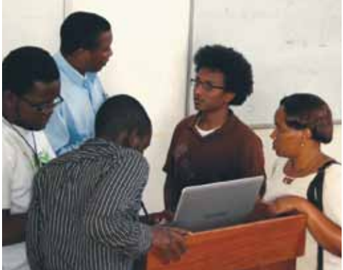
MEPI is bringing new technologies and library resources, including a reliable, high-speed Internet connection, to KCMC to facilitate access to research, information and learning tools.