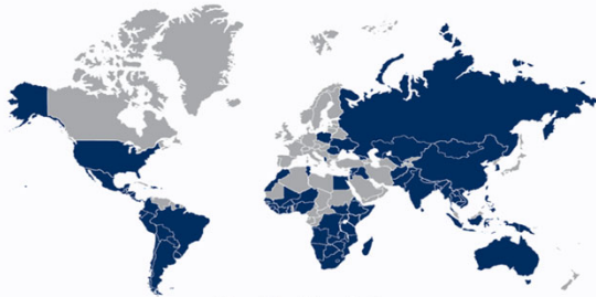
URC has worked in projects in over 90 countries.

University Research Co., LLC (URC) is a development technical assistance provider based in Chevy Chase, Maryland, specializing in health service delivery and quality improvement. URC's approach to development prioritizes localization, leadership, solutions, and sustainable change to achieve project goals and sustain them after the projects end.